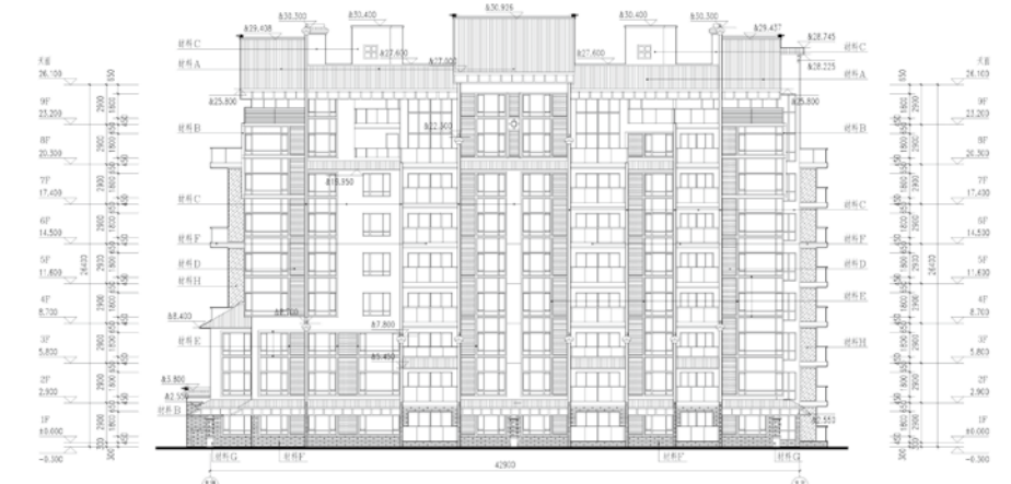
轴立面图 Side Elevation

紫园的设计理念早已超越了建造一个居所，而是建造一座满足人对自然、艺术、时尚、尊贵等多重需求的完美居住空间环境。设计中不是死板地照搬传统古建筑中的元素和符号，而是经过精选与提炼，最后探求一种富有深厚东方新人居之韵味，设计出完全符合现代人居住需求的人居环境。从精致到细节，带给住户一个集娱乐、休闲与品位于一体的生活居所、休闲的港湾！