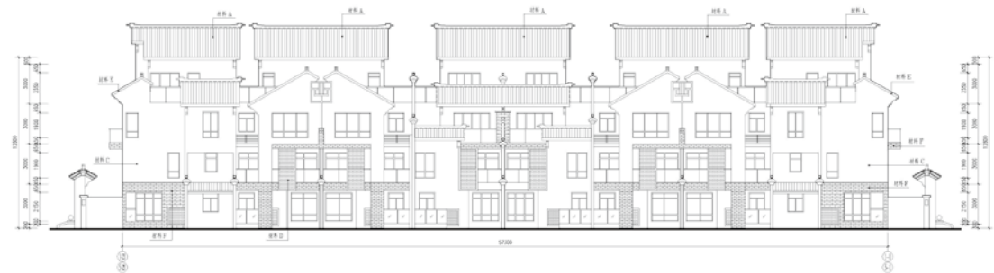
轴立面图 Side Elevation