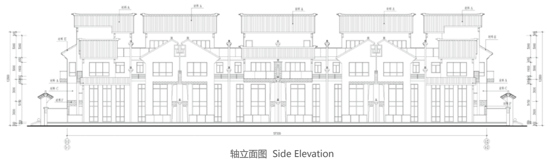
轴立面图 Side Elevation